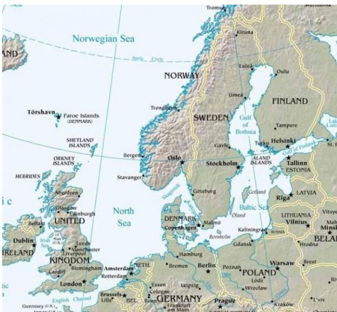
Map 2. Norden in a North-European perspective